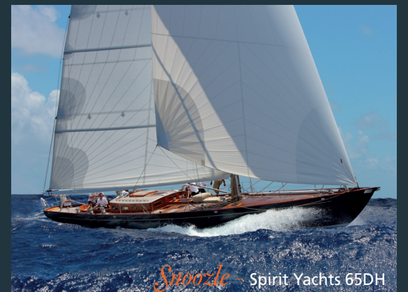
Snoozle - Spirit Yachts 65DH