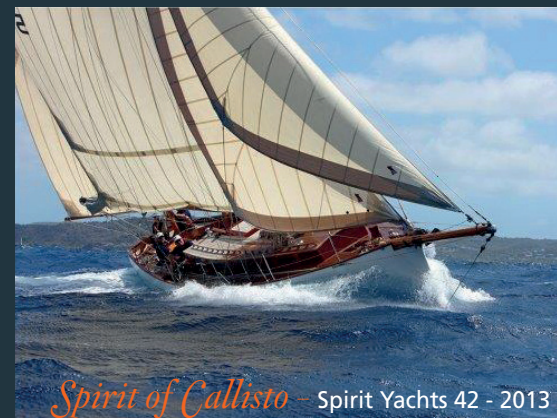
Spirit of Callisto - Spirit Yachts 42 - 2013