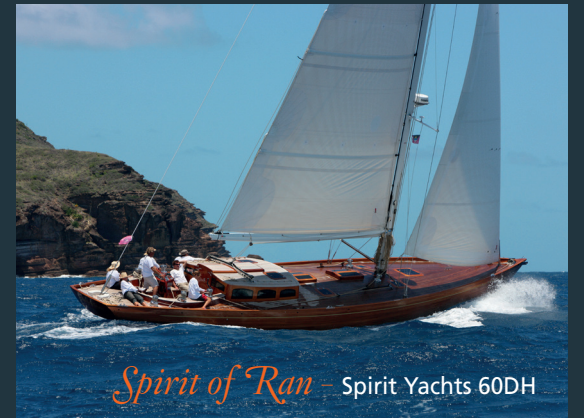
Spirit of Ran - Spirit Yachts 60DH