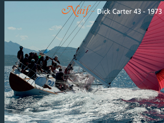
Naif - Dick Carter 43 - 1973